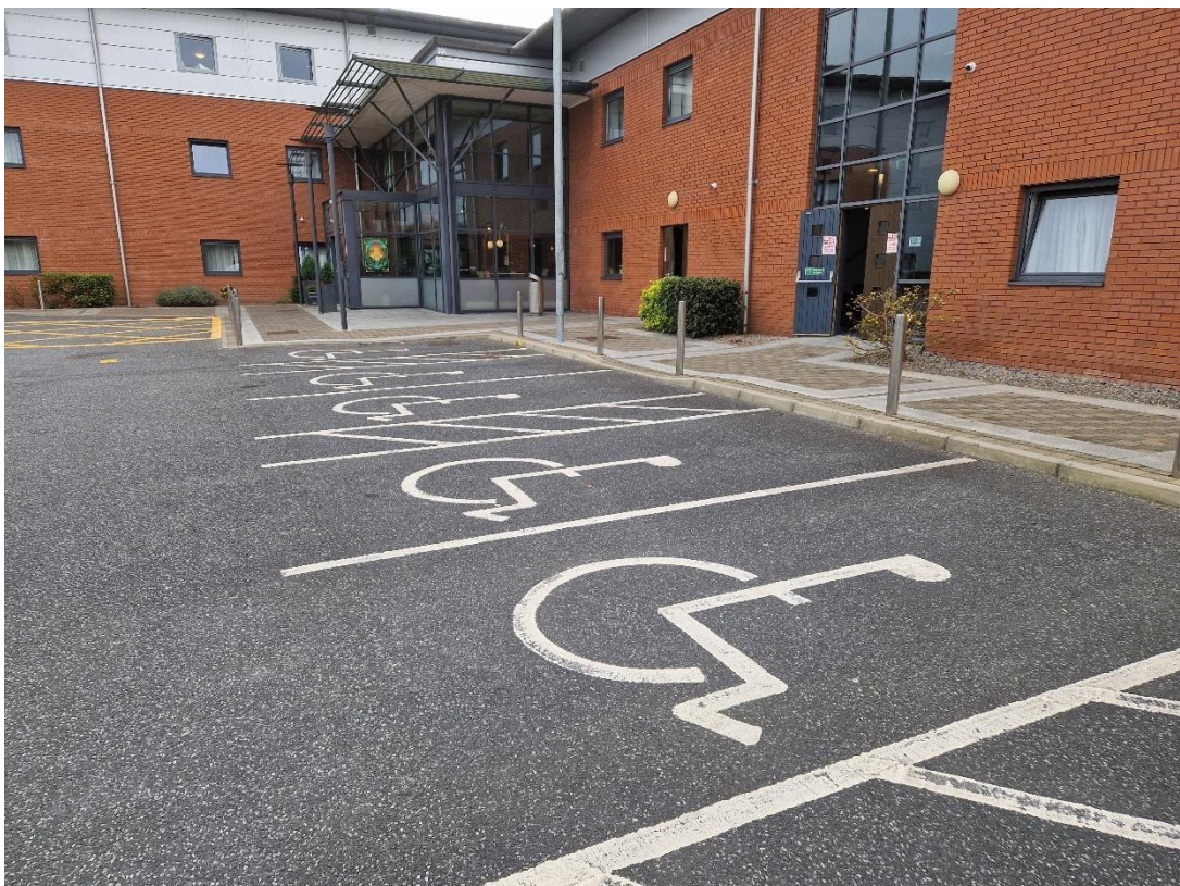
Parking: Feature and description